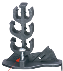
#8 self-tapping sheet metal screw CS20SC

Supports up to four 14/2 - 10/2 flat (any combination) and two 14/3 - 10/3 (any combination) NM cables.