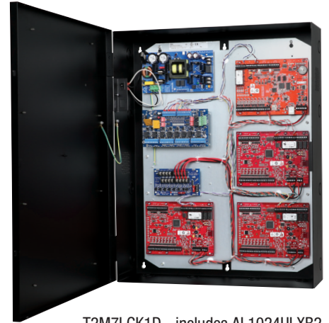
T2M7LCK1D - includes AL1024ULXB2, ACMS8CB, VR6, PDS8CB, wire harnesses and wire magnets