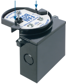
Locator posts for positioning of bracket installation screws