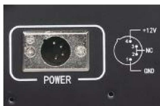
XLR Power Interface