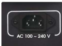
AC 100~220V Power Interface