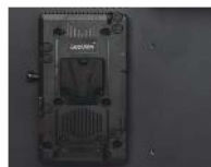
V-mount battery plate