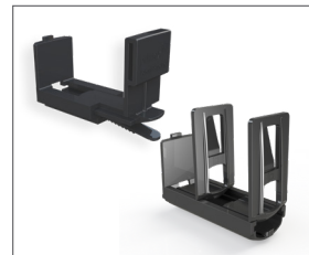
Single & double mounting brackets (RMB/RMB2)