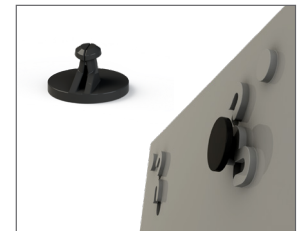
Keyhole mounting bracket (KMS)