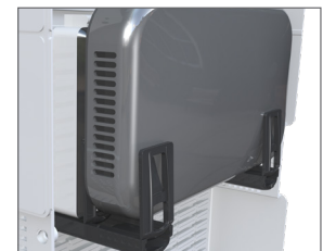
Multiple component mounting