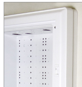
P3000 with 2 Frame Extenders stacked