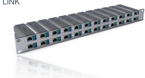
Up to 24 LONGSPAN devices can be mounted in a 1U rack space. Ask for VLS-1U.

Distances may be increased by connecting multiple links in series. Data rate at full range stated: 100Base-TX = 200Mbps, 10Base-T = 20Mbps