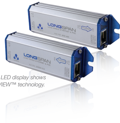
Smart LED display shows SAFEVIEW™ technology.

LONGSPAN delivers unrestricted 100Base-TX with 802.3af and 802.3at POE at distances far beyond the normal Ethernet limits for problem-free IP camera installation.