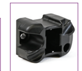
Palm Guard Insert