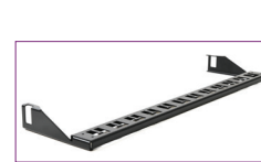
1U 24-Port, 2U 48-Port Rear Cable Manager