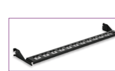
1U 48-Port Rear Cable Manager