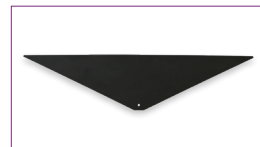
Angled Panel Cover