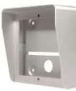
(1) Surface aluminum back box with standard rainhood for the NEXA panel (model# N871/AL shown)