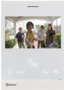
ART4XLITE/G2 Surface Mount 4.3" Indoor Video-Intercom Monitors (qty. of 1 to 10 depending upon kit selected)