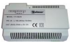
(1) FA-G2 System Power Supply/Amplifier