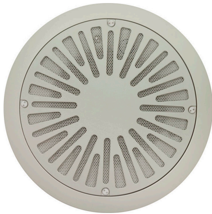
RECESSED: Model LUH-VRG grille mounted to the Unihorn in a recessed application, with the horn's trim ring in place.