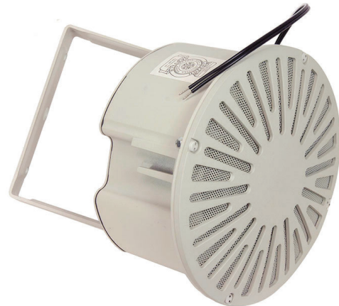
SURFACE-MOUNT: Model LUH-VRG grille mounted to the Unihorn in a surface-mount application using U-bracket Model LUH-BRKT (horn's trim ring is not used).