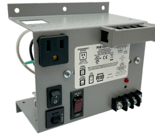
PSB100AB10 100 VA Power Supply