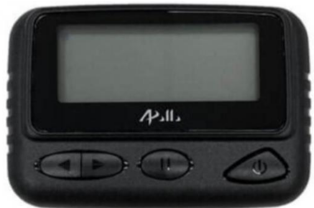
Model PGR-AL700 Alphanumeric Pocket Pager