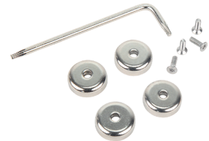
[ AMGMNT-MAG Series* ]