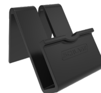
Enrollment reader stand