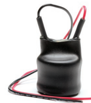
Magnetic lock kit