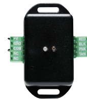
Advanced Security Module