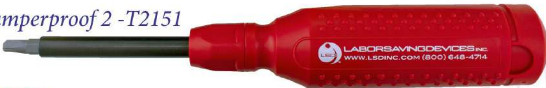
Tamperproof 2 - T2151

The most versatile screwdrivers on the market!