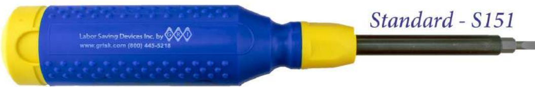
Standard - S151