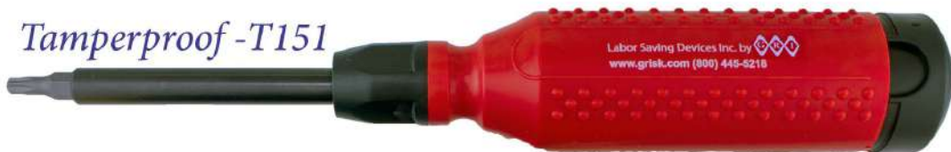
Tamperproof - T151