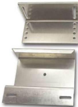
8299-G Mounting Kit Includes S412P-G, M-402, brackets and hardware