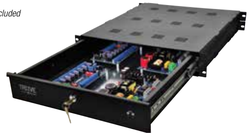
Trove1AL1R with two (2) Altronix power supply/chargers and sub-assemblies