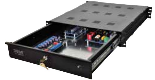
Trove1AL1R with one (1) Altronix power supply/charger and sub-assemblies