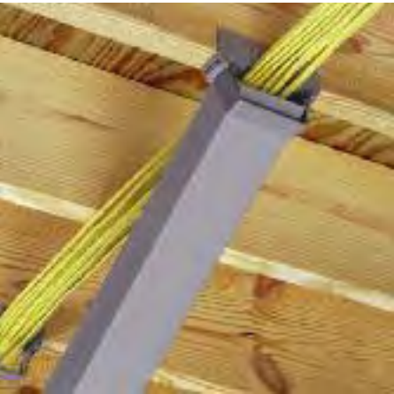
4 When the desired number of cables is run, install cable trough by tilting the trough into the first bracket, sliding it under the installed cables. Raise the trough as it is inserted further into the support bracket.