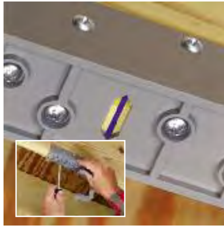
2 Install support brackets to framing members. Install brackets a maximum of 32" apart and within 16" of each end of the runway. TIP: Use center window in bracket for alignment with chalk line. TIP: Bracket hinge can be opened for ease of attachment to framing if desired. Simply lift lower portion up and flex catch inward slightly to open.