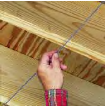
1 Strike chalk line in desired location for CableWay™.

Rated for a maximum load of 6 lbs/linear foot of runway