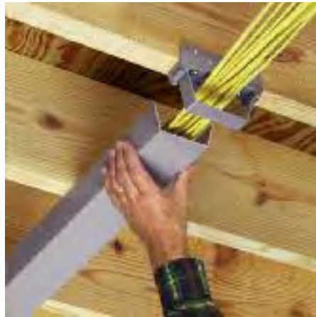
5 When the trough sits level in the bracket, slide the trough (wire tray) back into a second bracket. Install additional sections, using couplings to join the pieces in the same manner. Couplings push-on to the ends of the raceway.