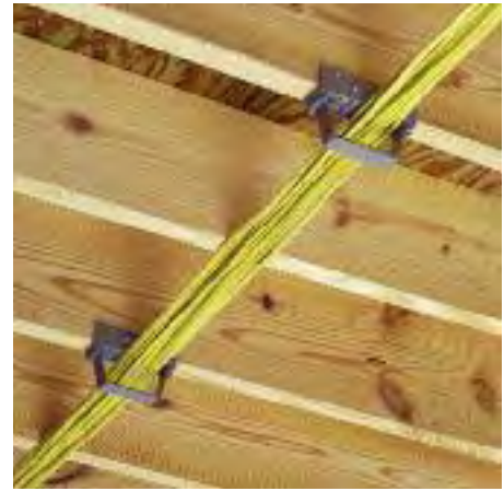
3 Run cables through the installed support brackets. Support brackets can be opened if desired.