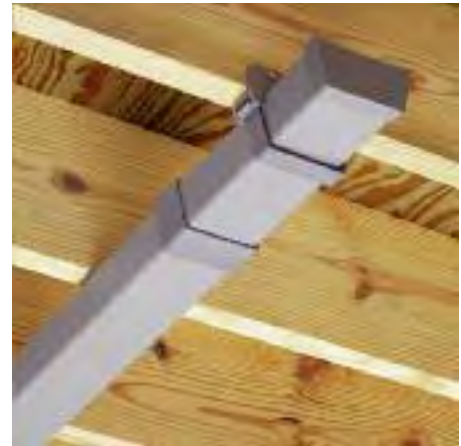
6 The last section of raceway may need to be cut to fit. Install end caps where the cable runway system terminates. End caps simply push on to the ends of the trough.