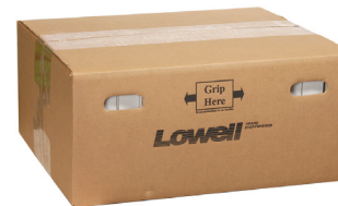
Available in multi-pack contractor cartons.