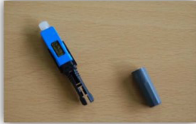
1. Check the parts, insert boot to cable