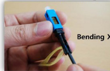
8. Release the bending