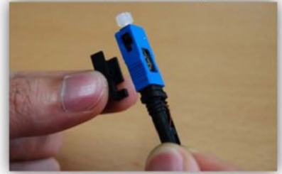
6. Pull out the Jig