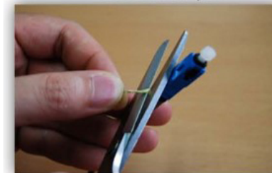
10. Cut the yarn