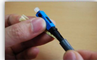
9. Lock the boot with yarn