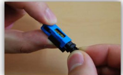
3. Check Jig setting