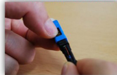
7. Press the button (Yellow cover)