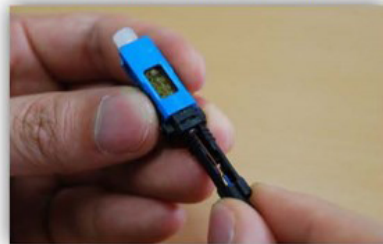
4. Insert the fiber to connector