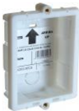
(1) Flush plastic back box for the NEXA panel (model# NCEV-90CS shown)