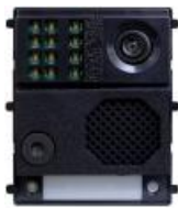
(1) EL632/G2SE Camera and Speaker/Mic. Module (installed into the NEXA panel)