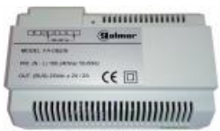
(1) FA-G2 System Power Supply/Amplifier