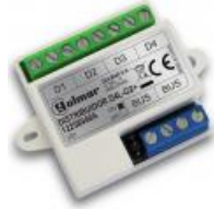
D4L-G2/SMALL 4-way video bus splitters (qty. of 0 to 3 depending upon kit selected)