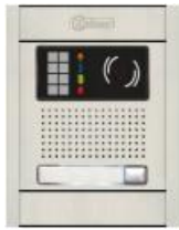
(1) Aluminum NEXA Door Station (supplied with FLUSH back back box), with 1 to 10 push-buttons. 1-Button model shown