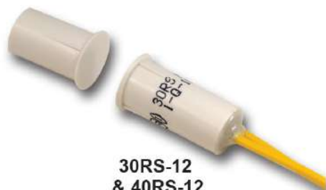
30RS-12 & 40RS-12 .780"