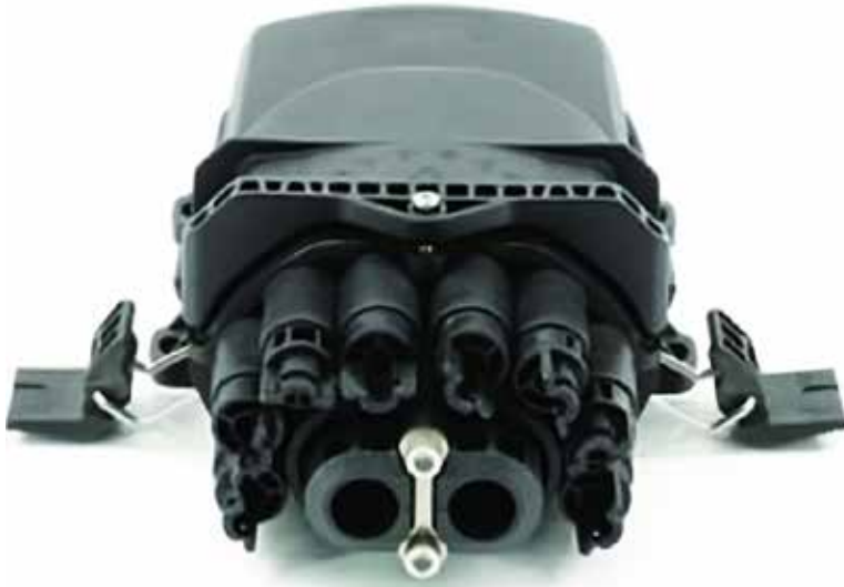
Cable Port View