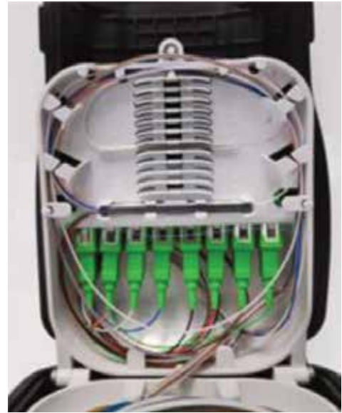
Open Splice Tray