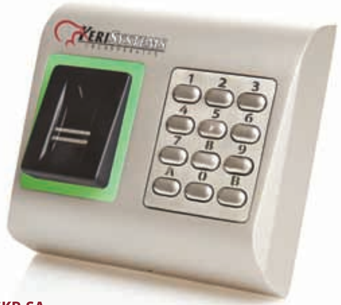
B100-SKP-SA Swipe-Fingerprint + PIN

Keri's B100-SKP-SA™ Readers provide reliable swipe- fingerprint reading in attractive and unobtrusive packages. Typically for small and medium installations, these readers can be used in residential areas, homes, offices, gate automations and other applications where high security is needed but simple installation is required.