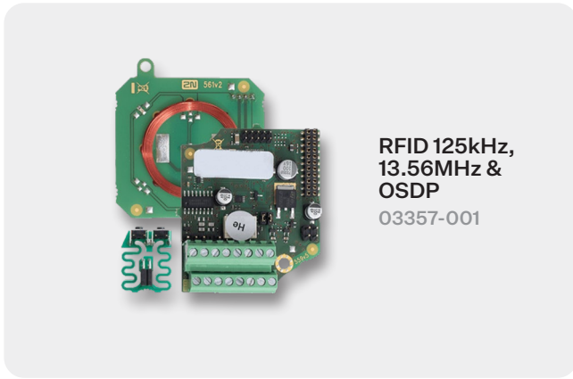
RFID 125kHz, 13.56MHz & OSDP 03357-001