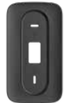
KMOUNT Mounting Plate

All the information contained within this document (pictures, drawings, features, dimensions, specifications), could be perceptibly different and can be changed without prior notice. Published: 08 September 2025. CDVI_KPROX_DS_01_EN-FR_LETTER_C-Americas