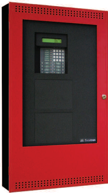
Model MR-2351 shown