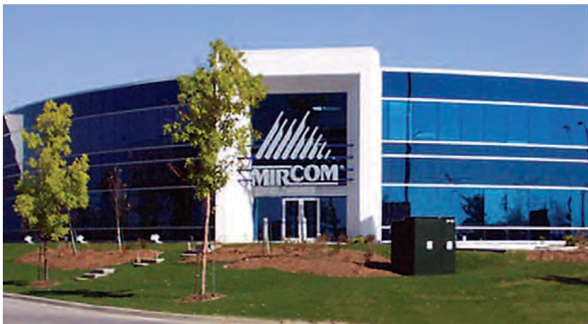
Corporate head office and manufacturing facility, Vaughan, Ontario, Canada

25 Interchange Way Vaughan, Ontario L4K 5W3 Tel: 905.660.4655 Fax: 905.660.4113